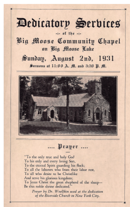
From the dedicatory pamphlet, August 2, 1931.

There was an article with a nice write-up about the Chapel in Utica's ACCENT